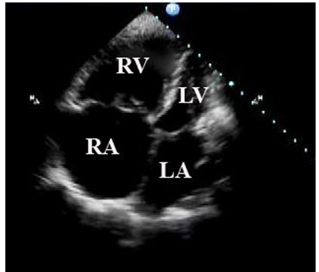
Figure 1. Right ventricular dilatation (right ventricle:left ventricle ratio >1:1) in this apical 4-chamber image of a patient with an acute pulmonary embolism. RV, right ventricle; LV, left ventricle; RA, right atrium; LA, left atrium.

Bedside echocardiography may be a useful addition to diagnostic protocols for suspected pulmonary embolism, but how much it adds to other clinical findings remains to be determined.